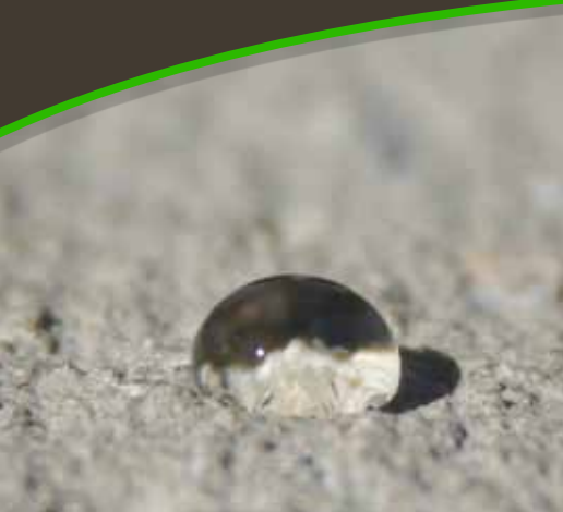
Water Absorption (%) under BSI 1881-122