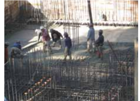
With Hycrete's integral waterproofing solution, a direct pour of concrete waterproofed the structure, in spite of the groundwater.