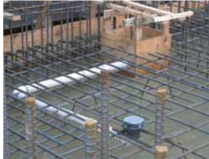
Constant influx of groundwater made use of a bentonite waterproofing system almost impossible.