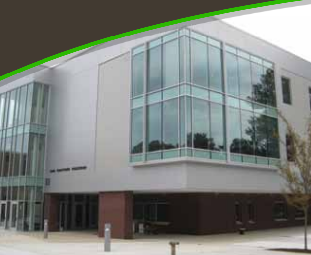
Yorktown High School, Arlington, VA