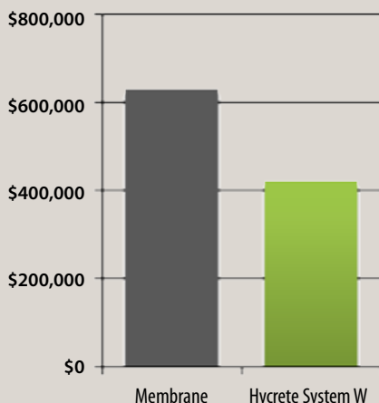
Comparative Material Cost