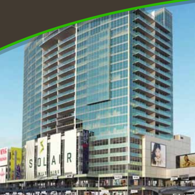
Solair Wilshire, Los Angeles, CA