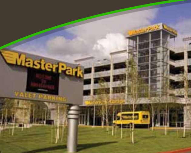
MasterPark Garage, SeaTac, WA